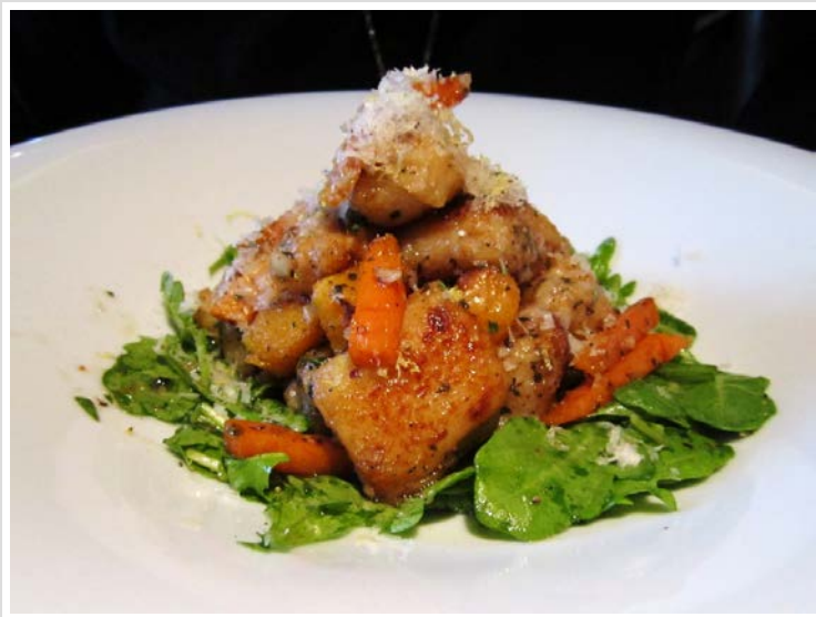
Nice Little House Salad, perfect!!