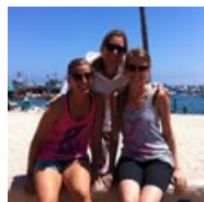
Catching up with one of the ambassadors