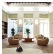
Beauty bliss: Aloe Vera and Rum Massage in Aruba