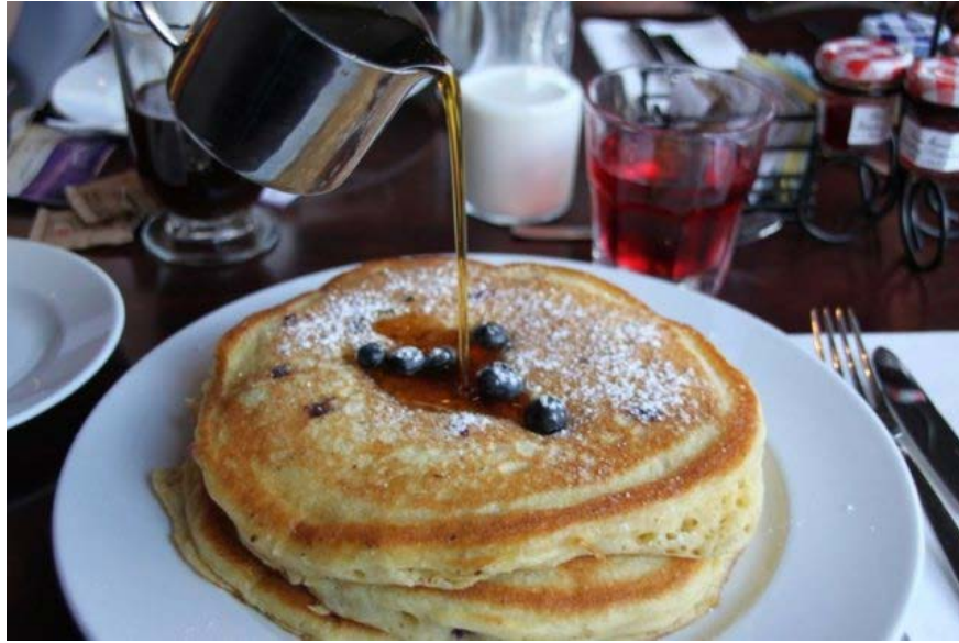
Giant buttermilk pancakes at The Counter in The Thompson