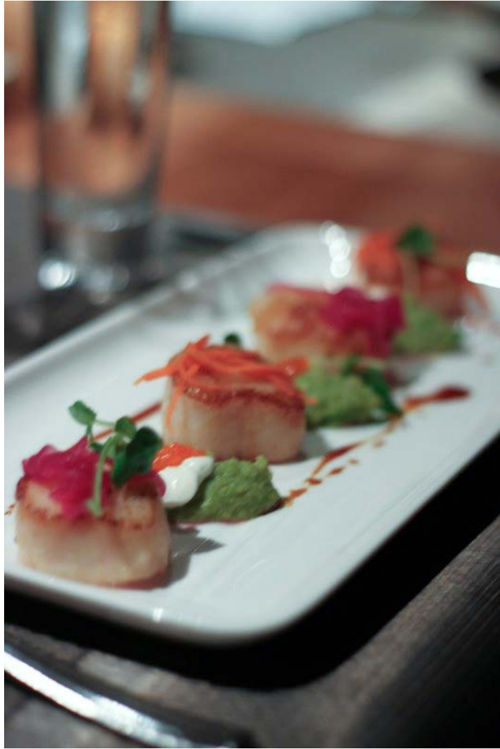
Scallops at Toka