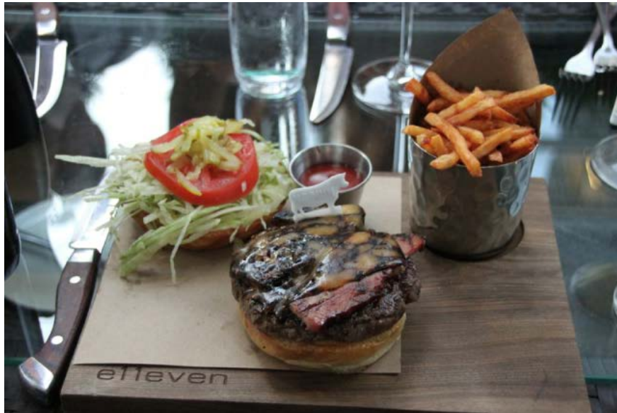
Maple Burger at E11even (with local craft beers)