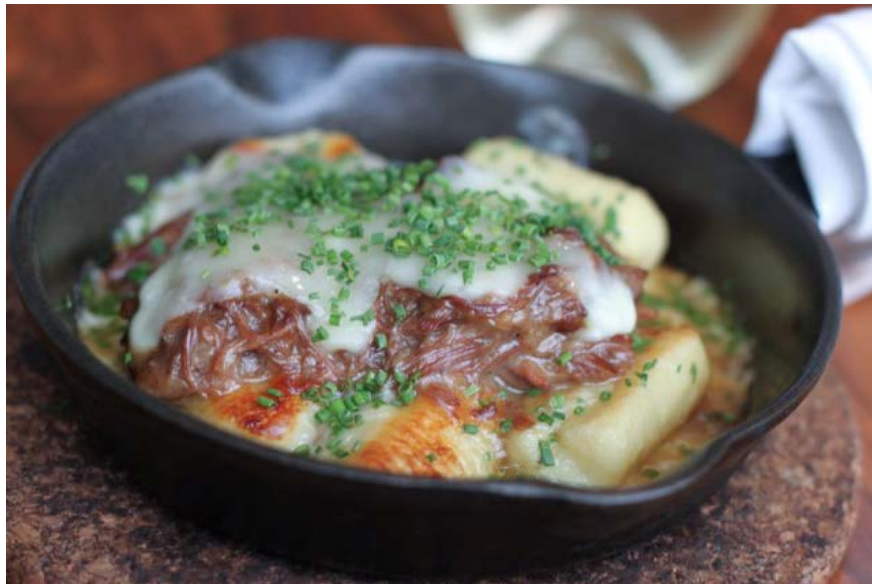
Gnocchi Poutine with Oxtail Ragu at Mildred's Temple Kitchen