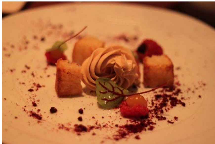
Tasting Menu at Colborne Lane

As soon as I get some time, I hope soon, I will publish a proper piece on my favourite places so that you can find them when you visit.