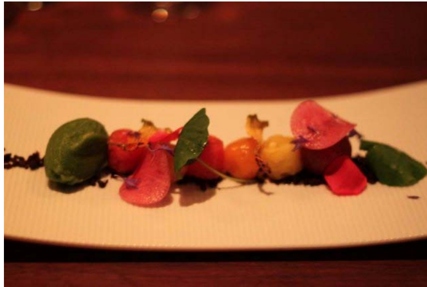
Tasting Menu at Colborne Lane